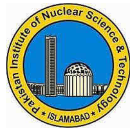
Institute of Nuclear Sciences