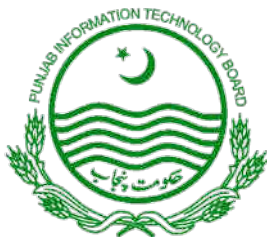
Punjab Information Technology Board