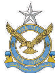
Pakistan Air Force